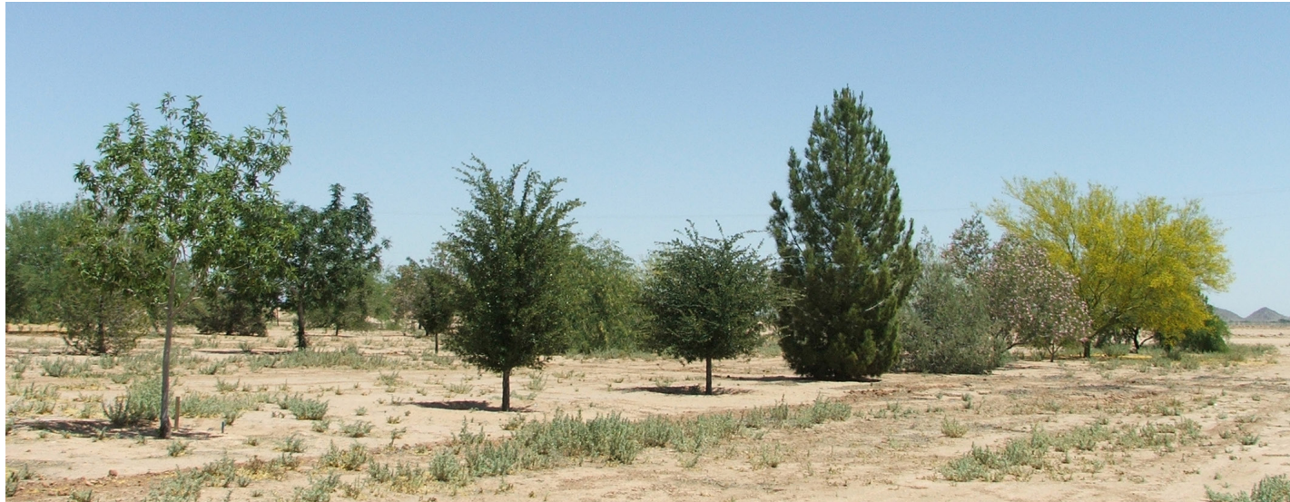
Figure 3. Trees that maintained good quality when irrigated with the wet treatment for four seasons. (March 2014).