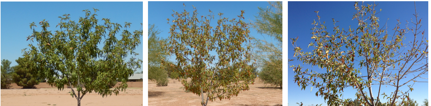
Fig. 8. Rio Grande ash canopy healthy (left) and increasing stages of defoliation and leaf burn (middle and right).