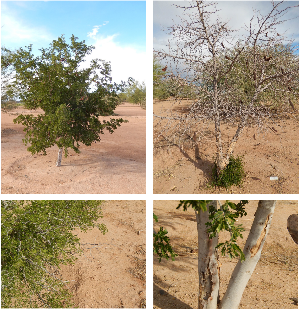
Fig 7. A healthy and a dead Texas ebony (top). By June 2014 several Texas ebony trees showed partial defoliation, branch dieback, and damage to the trunk (bottom).