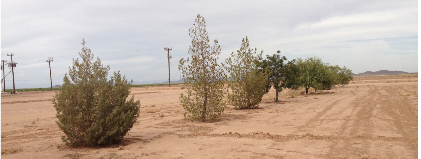
Fig. 5. Trees in June 2014, previously under the dry (top) and medium (bottom) treatment, and without irrigation since the beginning of March 2014.