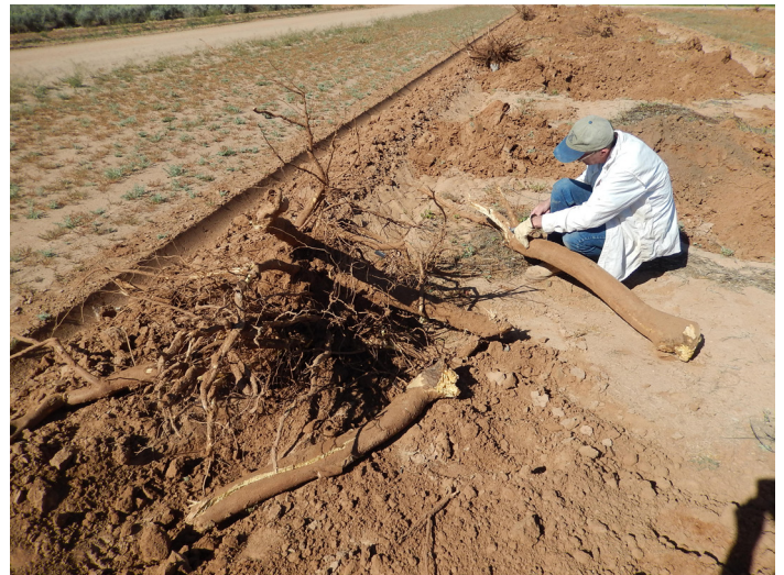
Fig. 9. The coarse root system of palo verde had the largest diameter roots and the greatest number of roots growing straight down into the soil.