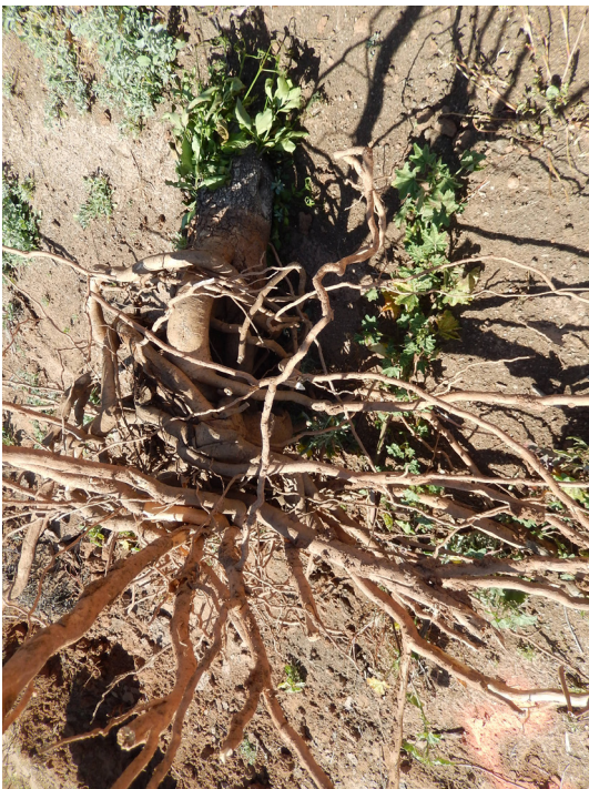
Fig 12. Roots of Rio Grande ash were severely root bound and girdled.