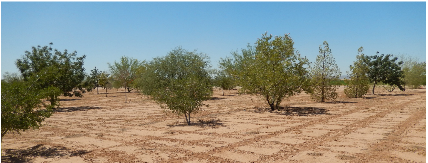
Fig. 6. Summer rains resulted in some trees growing new foliage and recovering from the drought by August 2014.