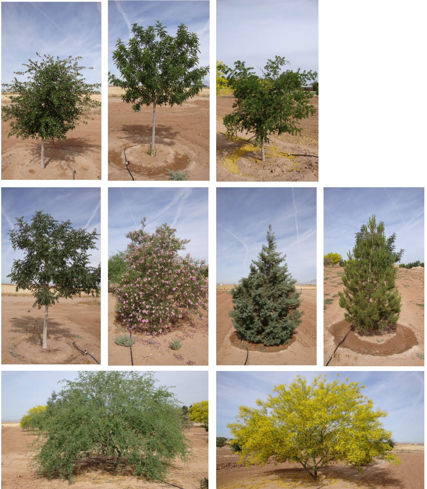
Fig. 1. Plants in May 2010 at the beginning of the irrigation experiment. Upper row left to right: live oak, Rio Grande ash, Texas ebony; middle row left to right: Red Push pistache, desert willow, Arizona cypress, Afghan pine; lower row left to right velvet mesquite and palo verde hybrid.