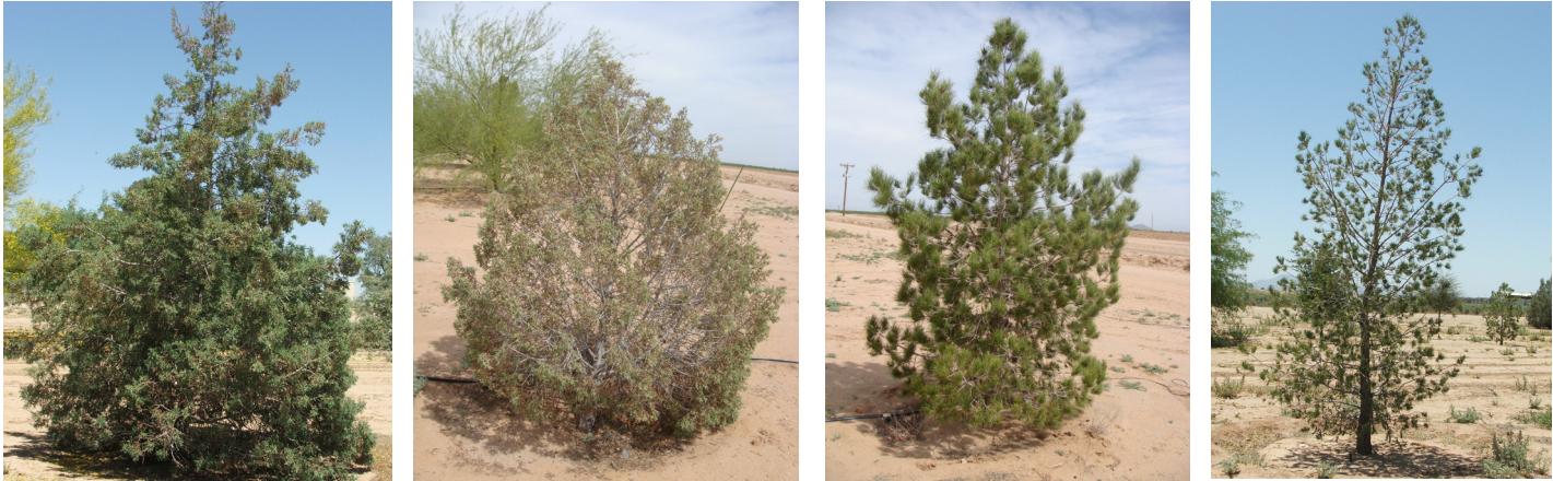
Figure 4. Arizona cypress (left two images) under wet and dry irrigation, and Afghan pines (right two images) under wet and dry irrigation treatments.