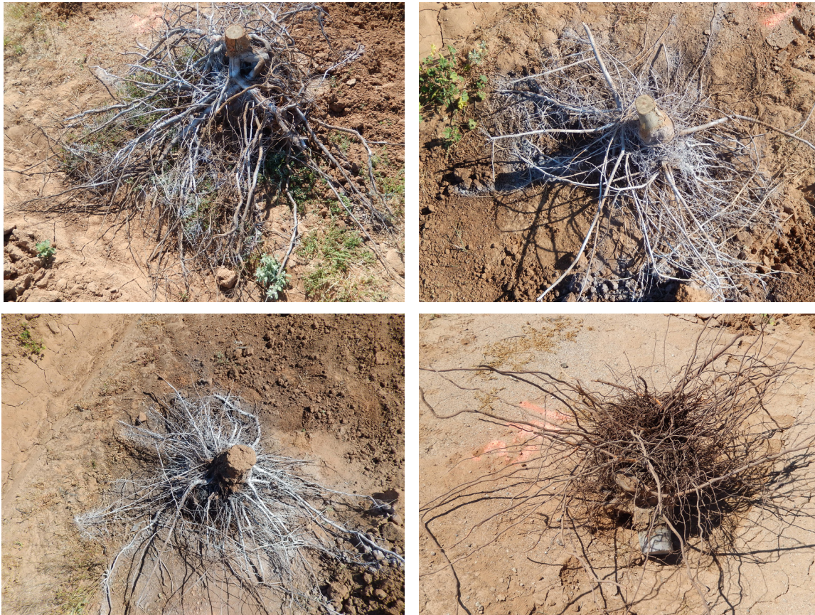
Fig. 11. Live oak (top left) and Texas ebony (top right) root systems had a few larger diameter roots and were intermediate in fibrosity. Afghan pine (bottom left) and Arizona cypress (bottom right) root systems had the smallest diameter roots and the greatest percentage of fibrous roots. Root systems of live oak, Texas ebony, and Afghan pine were sprayed with white paint to improve the visibility of the roots.