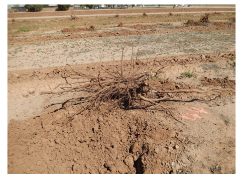
Fig. 10. Desert willow (left), mesquite (middle), and Red Push pistache (right) developed large diameter roots that grew primarily horizontally and well beyond the irrigated area. Desert willow and mesquite had a coarse root system with few fibrous roots, while the pistache root system had more fibrous roots.