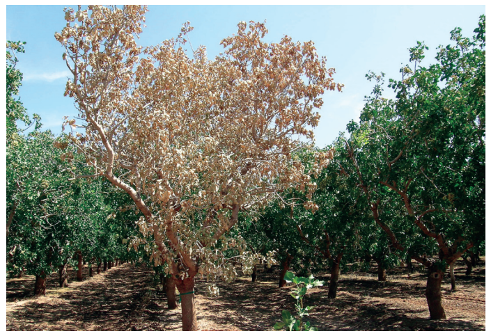
Figure 3. The entire tree such as this pistachio may die suddenly in a few weeks.

may die suddenly in a few weeks (Figure 3) or slowly over a period of years. These symptoms may be confused with cotton (Texas) root rot in hosts that are susceptible to both diseases such as pistachio. Since roots are not rotted in Verticillium wilt and discoloration of the vascular system is not characteristic of cotton (Texas) root rot, it is easy to distinguish the two diseases.