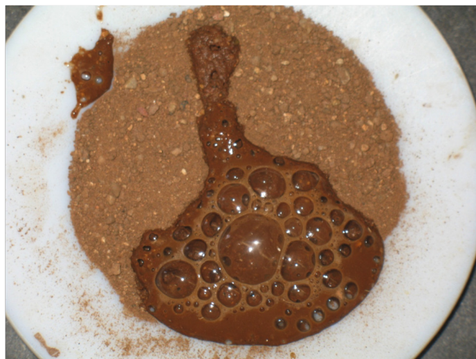
Figure 2. Calcareous soil effervescing when acid is applied.

Any acid can dissolve soil CaCO 3 and release the bound Ca. Sulfuric acid is most common because it is relatively inexpensive and adds less salt to the soil than hydrochloric acid (HCl). Sulfurous acid (H 2 SO 3 ) can be produced by combustion of elemental sulfur in a 'sulfur burner', which is a popular alternative to sulfuric acid. Additionally, acid-forming materials such as elemental sulfur can be used. Elemental sulfur is converted to sulfuric acid by sulfur oxidizing bacteria, producing the same effect as sulfuric acid. Sulfur conversion is a biological process, however, and requires several weeks to months to take place (depending on soil conditions), unlike acids, which react instantly.